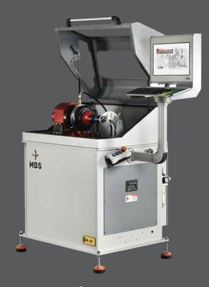
\overline{\mathrm{CB}} - 30Big Group from 43 to 105 mm