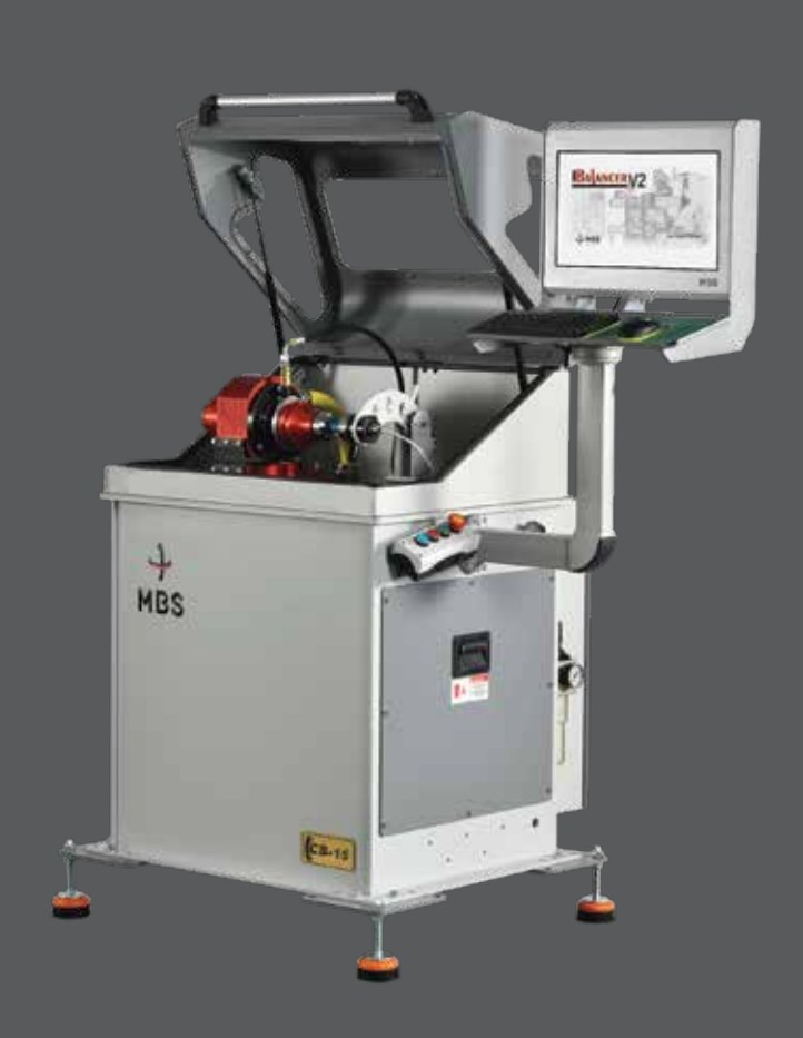
\begin{array}{c} \hline CB - 15 \\ \hline \end{array} Small Group from 28 to 65 mm