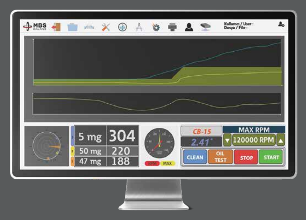
Balancing interface is in every language. Incredible sensitive measurements with our the most advanced software.